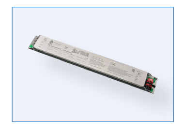
R83101 LED ISO adjustable power driver