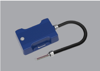
R83010 RENO-EM-EX15 All weather emergency LED Driver

ARCHITECTURAL LUMINAIRES BY RENO LIGHTING